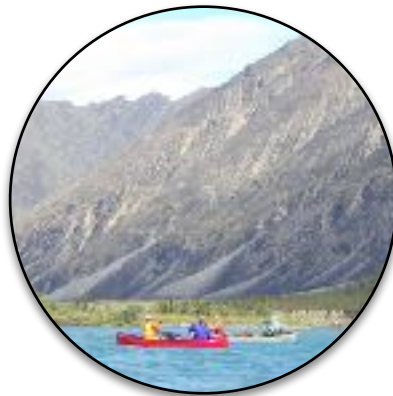
AHA! ADVENTURES PAGE 11