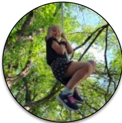
SUMMER CAMPS PAGE 5