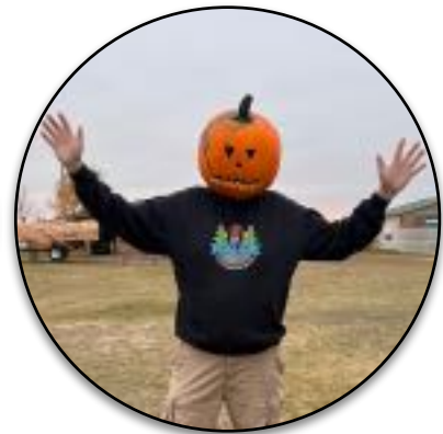
CORN MAZE PAGE 12